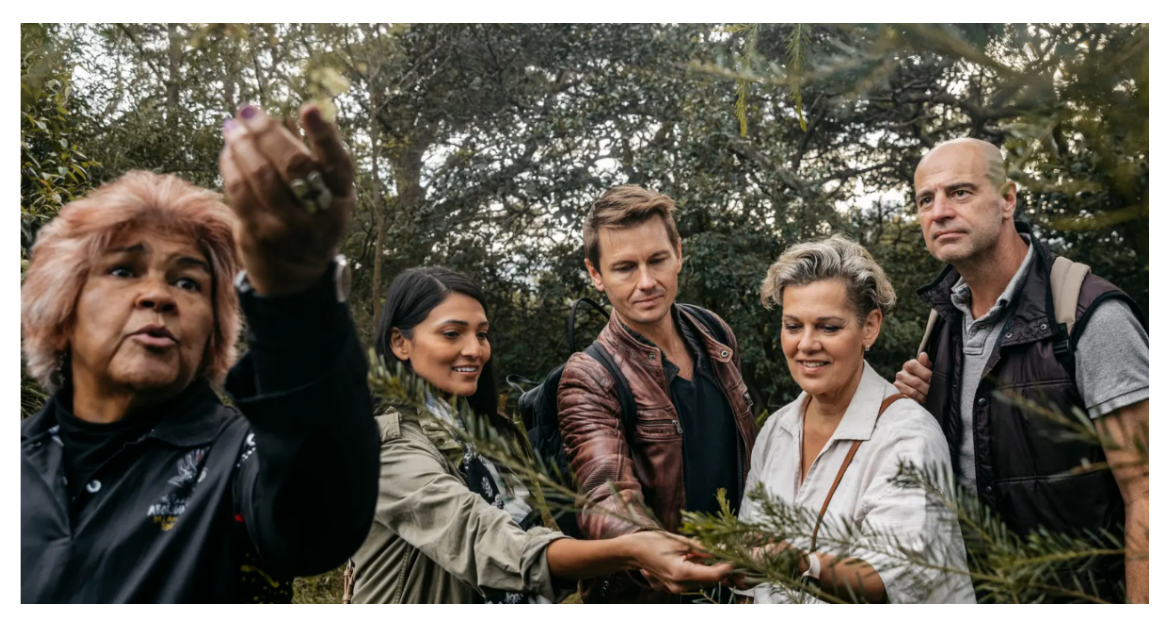
Grants and Funding Opportunities