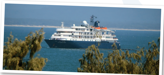
A tourism highlight of the last financial year was MS Caledonian Sky visiting Trial Bay

During the year, Council hosted a visit from passengers aboard luxury cruise ship MS Caledonian Sky who docked at Trial Bay at South West Rocks and other successful events including the