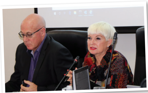
Council's first public forum under the new Code of Meeting Practice was held in June

For more information about Council's new Code of Meeting Practice, visit: www.kempsey.nsw.gov.au/meeting-practice