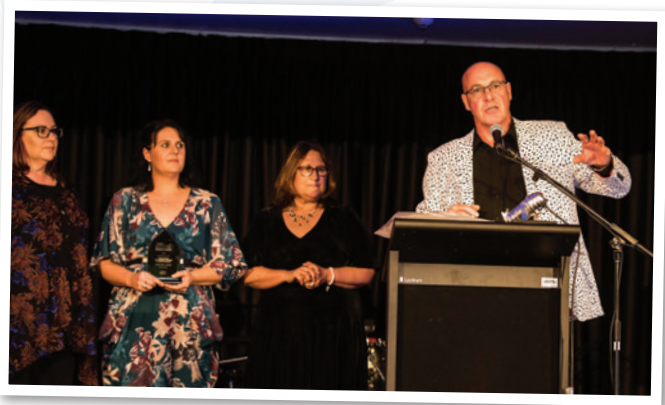
Council was awarded Excellence in Professional Services and Employer of Choice at the 2019 MVBA's

In 2019-20 we will seek feedback on the Community Infrastructure Strategy, Local Character statements and development of management plans for reserves and Holiday Parks.