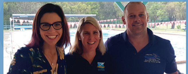
Managers of Crescent Aquatic Centre recently received a defibrillator device for the facility

Three of Kempsey Shire's aquatic centres have taken delivery of a lifesaving device that will benefit pool patrons by improving emergency first aid responses.