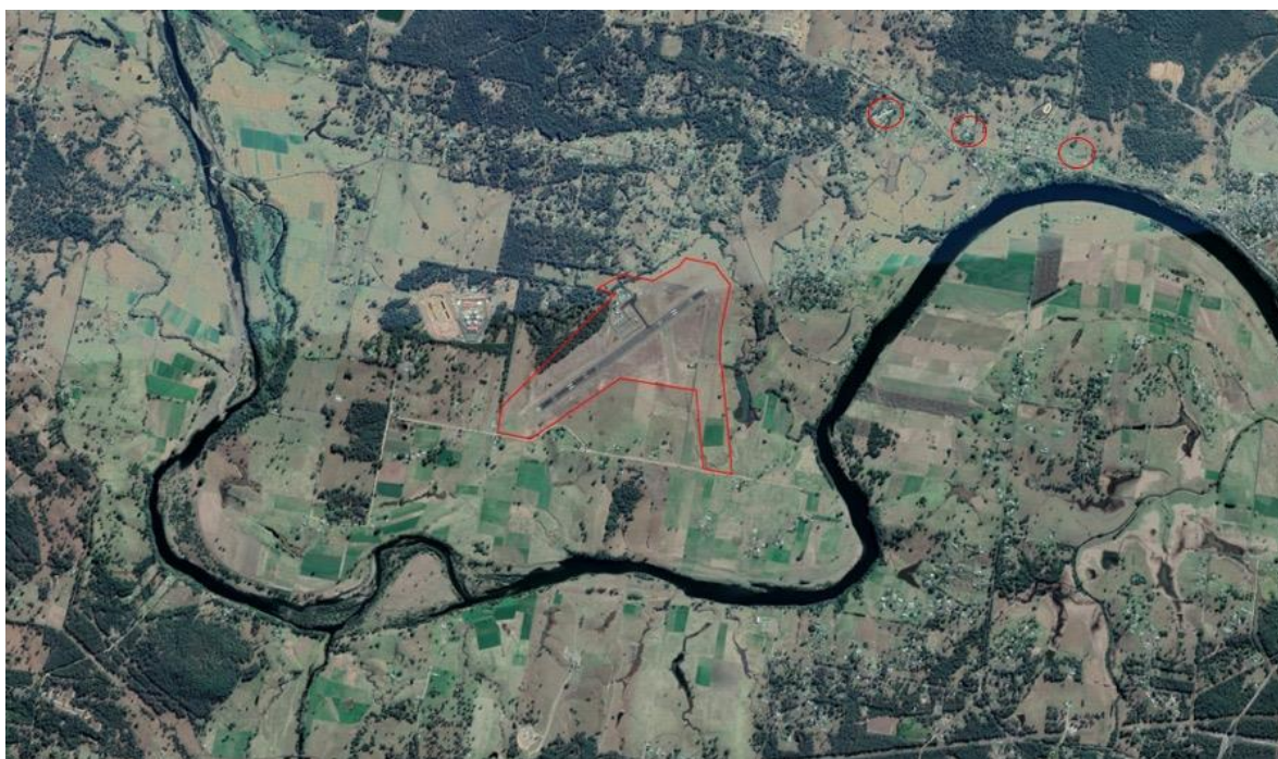
Figure 1: Location of Noise Sensitive Areas from L-R: Aldavilla Primary School, Booroongen Djugun Aged Care Facility and the Greenhill School

There are three facilities near Kempsey Airport that may be considered Noise Sensitive Areas. These facilities are the Aldavilla Primary School, the Greenhill School, and Booroongen Djugun Aged Care Facility and are identified in Figure 1, below.