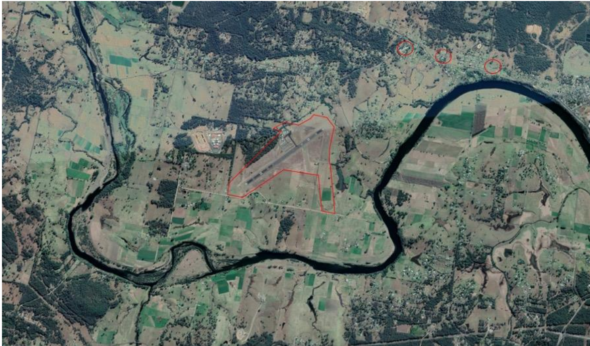
Figure 2: Location of Noise Sensitive Areas from L-R: Aldavilla Primary School, Booroongen Djugun Aged Care Facility and the Greenhill School.

It is important to note that these Noise Sensitive Areas are located north-east of runway 04/22. These areas are under the runway centreline approach to runway 22 and as such cannot be avoided in their entirety. As per CASA regulations, aircraft must be aligned with the runway centreline by at least 500 feet above the airport elevation when approaching to land. When considering a standard flight path, aircraft will be inherently overflying these Noise Sensitive Areas.