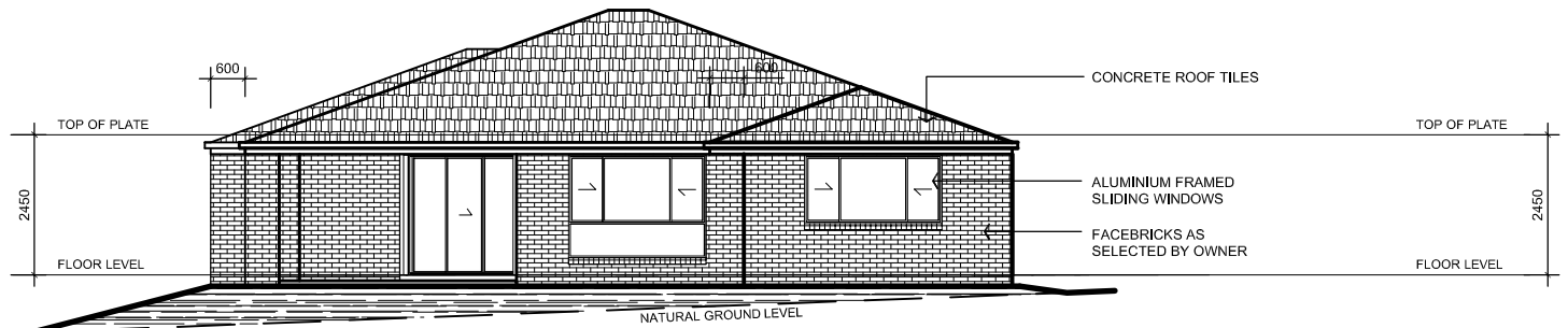
WEST ELEVATION SCALE 1:100