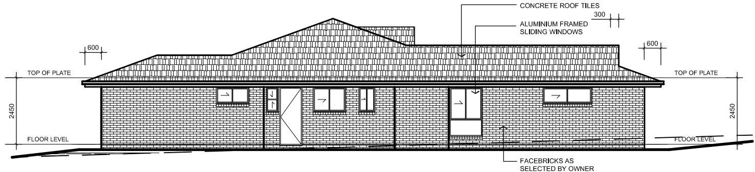
SOUTH ELEVATION SCALE 1:100