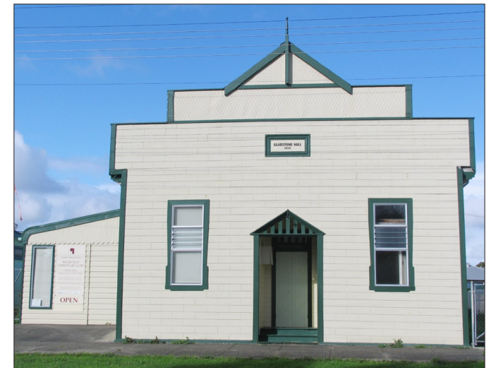
Gladstone Hall and Art Centre