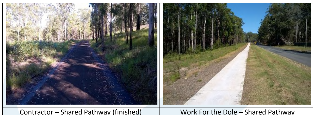
Contractor – Shared Pathway (finished)